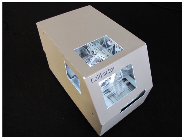
Figure 1: CellFactor in its newest form for analysis and sorting of small model organisms.

fertilization) and to dispense the latter into a multi-well plate for further processing. This greatly improves the efficiency of post treatment procedures of the fertilized eggs, as required by end-users that CSEM is in contact with.