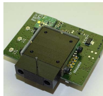
Figure 2: Fluorescence module with optical setup and electronic board with integrated digital lock-in amplifier.

The SmartPlate (see Figure 3) uses printed electrodes with conductive vias to monitor the samples in the well and read out the signals. The electrodes are biochemically modified with stable functional layers sensitive to pH, glucose and lactate.