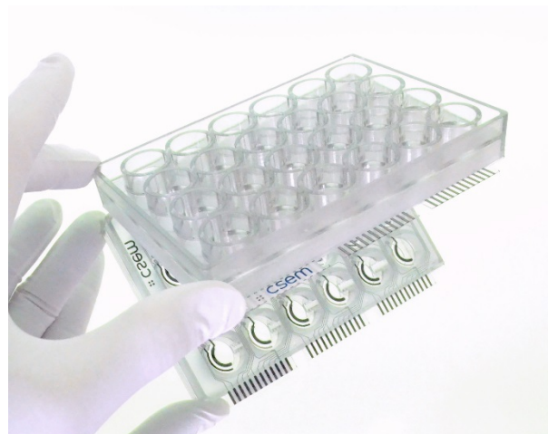
Figure 3: 24-well SmartPlate with printed and biochemically modified electrodes on the inside of the well contacted through conductive vias towards the outside to measure pH, glucose and lactate levels.

The SmartPlate (see Figure 3) uses printed electrodes with conductive vias to monitor the samples in the well and read out the signals. The electrodes are biochemically modified with stable functional layers sensitive to pH, glucose and lactate.