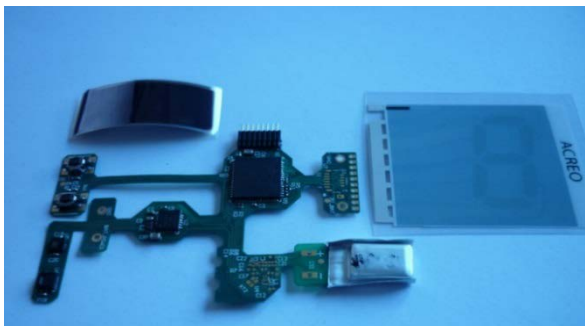
Figure 1: Generic and autonomous wireless patch.

The current GWAPO prototype patch (Figure 1) is comprised of 3 layers: The electronic layer, incl. pressure and temperature sensors, energy management, processing and communication; the PV cell and display layer; and the flexible battery layer. The electronic layer is optimized for 3D flexibility using flexible PCB technology on which the integrated circuits are placed on "rigidified" tiles in order to reduce the chance of breakage. Several concepts for electrical interconnection have been studied, from conventional to hybrid integration techniques, where sensors and energy harvesters are printed and integrated into the GWAPO thin patch.