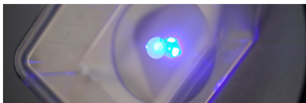
Figure 1: Fluorescent oxygen sensor in a tissue culture flask.

CSEM's optical oxygen sensors are based on the functionalization of thin mesoporous silica-based films with selective dye indicators such as ruthenium complexes. Thanks to their high porosity and surface area, the mesoporous sensing films have both a high optical density and fast response times. The sensing films can easily be produced using large-area industrial techniques. They are biocompatible, can be sterilized by autoclaving, and can be fixed to the inner surfaces of transparent disposable plastics, glassware or bioreactors. The only requirement is an optical access to sensing films in contact with the sample, and the oxygen concentration can be measured non-invasively through the wall of the container while avoiding any contamination of the sample (Figure 1).