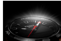
PV watch dial with up to 5x more power