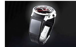
Flexible PV cells integrated into wristbands