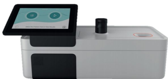
Figure 1: BIOCDx instrument, developed jointly with LRE medical.

The user-friendliness was increased by reducing the manual steps to a minimum. Meaning, the user receives the packaged, self-contained cartridge and inserts it into the instrument. Then the sample (currently a drop of blood) is loaded into the cartridge and the sample port is closed. The instrument then prepares (I) the cartridge, (II) the detector, and (III) filters the sample before it is (IV) analyzed. Finally, the operator reads the result and disposes the cartridge in which all liquids are contained in the waste compartments to prevent any contamination.