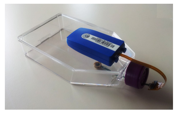
Figure 1: The online cell culture monitoring system CITSens Bio, adapted for the use in a T-flask.

Synthesis of bioactive molecules in bioreactors is nowadays routinely performed using single-use bioreactors. Control of the production lines in pharmaceutical companies is, however, still being performed with the same methods used in non-disposable bioreactors: by using traditional sensors which need to be sterilized and calibrated before each batch, or by sampling of the medium.