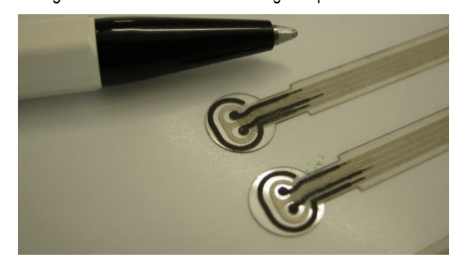
Figure 2: Screen-printed dual electrode sensors for multiple parameter monitoring.

The company C-CIT AG offers ready to use, pre-calibrated, pre-sterilized plastic-based sensors which are disposable, plug and play, and do not require any preparation (Figure 1). As they are single-use, the risks due to batch-to-batch cross-contamination are avoided, as well as the time consuming preparation and re-calibration between runs. The data acquisition system is connected wirelessly to a server for data storage and on-line remote monitoring for up to 2 weeks.