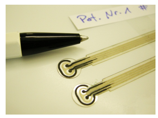
Figure 2: Screen-printed dual electrode sensors for multiple parameter monitoring

Since the market launch, users of the CITSens Bio system expressed a strong demand for a multi-parameter system. To respond to this need, combined sensors for glutamate/lactate and pH/ammonium are being developed (Figure 2). All-solid-state pH sensors are being developed and characterized in both calibration solutions and in cell culture. The sensors functional lifetime in cell culture conditions (T=37°C, 100% humidity, 5% CO<sub>2</sub>) has been verified for up to 2 weeks.