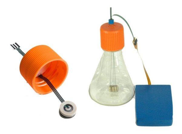
Figure 1: The CITSens Bio online cell culture monitoring system; (left) the sensor is introduced in cell culture systems caps; (right) the sensors in a suspended culture flask, and connected to the wireless data transmission system [1]

The company C-CIT AG entered the market of bioreactor monitoring in 2010, with the launch of the "CITSens Bio" lactate, glucose and glutamate sensors (see Figure 1). The ready to use, pre-calibrated, pre-sterilized plastic-based sensors are disposable, plug and play, and do not require any preparation. As they are single-use, the risks due to batch-to-batch contamination are avoided, as well as the time consuming preparation and re-calibration between runs. The data acquisition system is connected wirelessly to a server for data storage and on-line remote monitoring for up to 2 weeks. The system provides an alarm when the parameters exceed a threshold value, or alternatively the sensed values are injected in a feedback loop to adjust the cell culture conditions and keep the parameters within the optimal values.