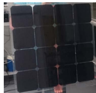
Figure 3: 16 indium-free cells demo module.

These very encouraging results were transferred on MBR tools with active support from CSEM, first on a semi-production scale tool and their full scale production scale allowing processing of 42 cells in one go. Initial runs on the large scale tool exhibited efficiencies 0.6 points below ITO reference but more recent results exhibited efficiencies 0.2-0.3 point below references, showing the results obtained at CSEM can be transferred on the production tools. Continuous process improvement is expected to further reduce the gap. Finally the reliability of cells using AZO was assessed and compared to ITO by testing 1 cell mini-modules for damp heat degradation ( 85^\circ\text{C} ; 85% humidity). It was observed that there is no significant difference between the two types of cells and the mini modules using AZO cells pass the IEC standard degradation test (<5% relative degradation for 1000 hours).