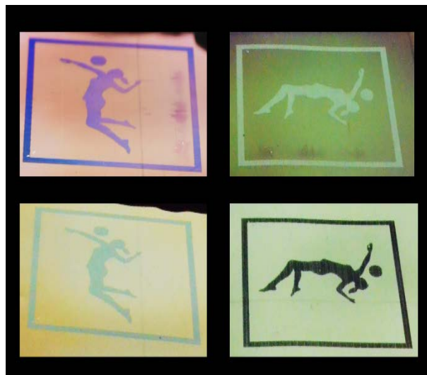
Figure 2: A plasmonic structure, bearing a volleyball player inkjet printed with high refractive index material, photographed in two different linear polarizations of light in two orientations.

refractive index material onto the plasmonic substrate and hence form a colored picture (Figure 1c and d).