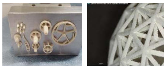
Figure 1: Different ceramic composite mechanical components (left); ceramic composite sphere with a 0.4 mm lattice (right).

example be used to fabricate lattice structures that form lightweight but resistant components. Two examples are presented in Figure 1 and Figure 2 which are respectively a sphere with a 0.4 mm lattice made of a polymer-ceramic composite, and a C letter made of polymer with 0.15 mm tetrahedral lattice. To achieve the realization of hybrid components, a substrate or an object that have received a surface treatment for adhesion promotion, can be loaded on the build plate. A fine alignment system is currently under investigation.