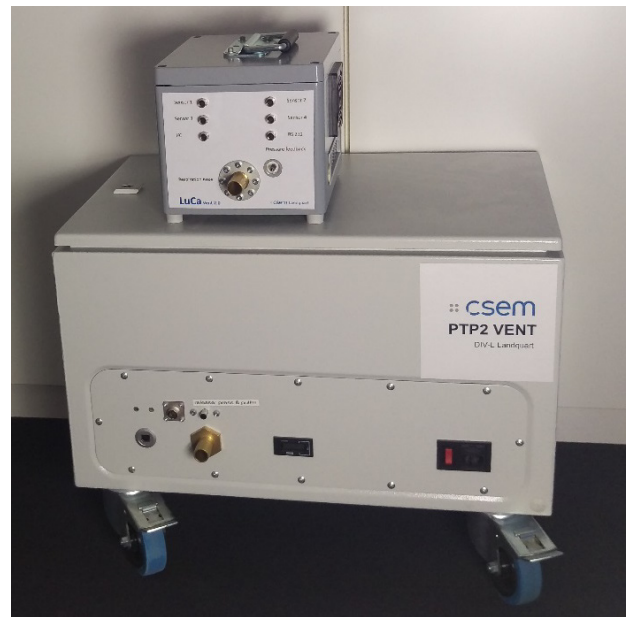
Figure 3: Size comparison of the two ventilation systems.

The obtained results of the redesign fully match the requirements and its usability aspects. However at the current stage of miniaturization we experienced thermal issues running the ventilation system at full power for long periods.