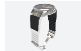
Flexible PV cells integrated into wristbands