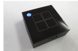
50 x 50 mm 2 wireless sensor with our PV cells